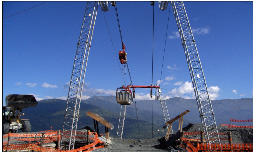
Figure 1: The aerial tramway loading area

material was wetted at excavation time and remained wet during the full trip from the source to the final resting position to reduce fibre dispersion. The aerial tramway (Figure 1) was removed after only 1.5 years of operation, having very successfully and efficiently completed the difficult task.