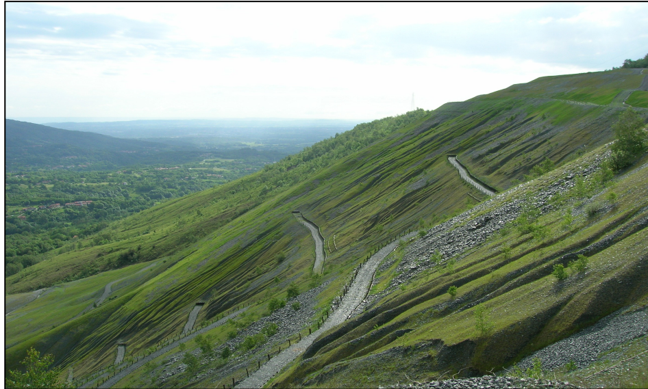
Figure 5: The final slope, after two seasons

The integration of geotechnique, hydraulics, pedology and risk management within the designers' multidisciplinary group led to a well balanced and environmentally sustainable project allowing the gradual recovery through natural processes of an otherwise highly compromised area.