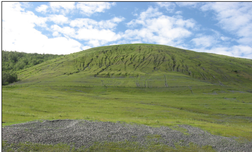
Figure 4: The re-vegetated slope

Success was achieved by stimulating the natural re-vegetation, restarting the pedo-genetic process and accelerating the colonization of superior species by implanting pioneer species. The use of mycorrhizae (special fungi pre-instilled in the root system of the newly planted vegetation), specialty hydro-seeding processes and autochthonous species have allowed to reach in few years outstanding results as shown in the figure below.